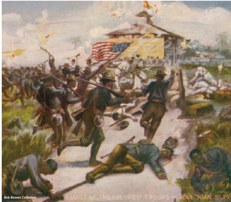
Post card showing the charge of San Juan Hill.

In February 1898, the battleship Maine mysteriously blew up in Havana's harbor, killing 260 American sailors. The war with Spain began in April. Over 3,000 Buffalo Soldiers served with distinction on the battlefields of Las Guasimas, El Caney, and San Juan Hill. They fought up San Juan Hill beside white regular army regiments and the 1 st Volunteer Cavalry—the Rough Riders—led by Lieutenant Colonel Theodore Roosevelt. After the battle, Rough Rider Frank Knox said, “I never saw braver men anywhere,” and Lieutenant John J. Pershing wrote, “They fought their way into the hearts of the American people.”