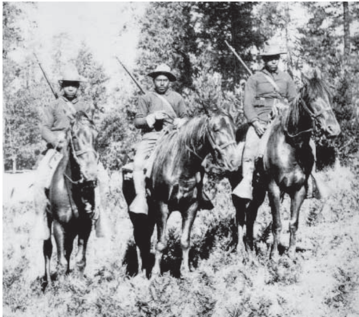
Twenty-fourth Infantry, Yosemite, 1899

On returning from the Philippine War in 1902, four 9 th Cavalry companies were garrisoned at the Presidio of San Francisco until 1904. Garrison life was largely uneventful, consisting of the usual work details and guard mount. However, in the spring of 1903, these units were assigned two special missions. They were to patrol Yosemite, Sequoia, and Kings Canyon national parks over the summer, protecting them from logging, livestock grazing, poaching and fires. In addition, "I" Company was to serve as special escort to President Theodore Roosevelt during his California tour, the first time black troops were given this honor.