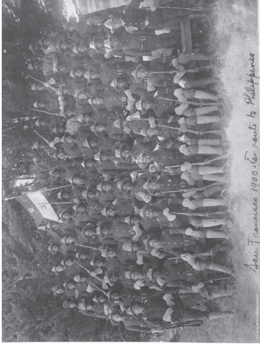
San Francisco 1900 - En route to Philippines

There was considerable opposition to the Philippine War within the African American community of the United States. Many black leaders and newspapers supported Filipino independence and felt it was wrong for the United States to subjugate non-whites in what was perceived to be the beginnings of a colonial empire. In spite of this, most African Americans felt that a good showing by Black troops in the Philippines would enhance their cause for equality at home.